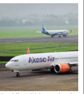
The airline which completed its second anniversary on Wednesday, flies 900 weekly flights to 27 destinations PTI

"Demand from customers on international routes connecting to various domestic points has been high. Some of the popular destinations