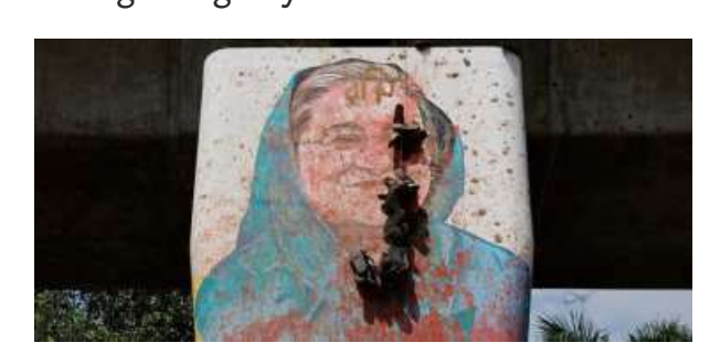
SIGNS OF ANARCHY. A mural of Bangladesh PM Sheikh Hasina vandalised by protesters, a day after her resignation,

"The Indian government is in kind of a diplomatic logjam. It cannot possibly ask Hasina to leave before she finds another country of asylum. But it also cannot risk keeping her here for long as it may then be branded as