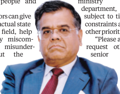
In a letter to secretaries, Cabinet Secretary TV Somanathan said that meetings with people should be held in offices and not hotels

“Such meetings should be in your office, and not in social settings, clubs, hotels etc. In some cases, if you feel it is necessary as a precaution, you could ask another officer to be present,” the letter said.