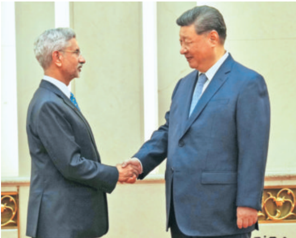
Union External Affairs Minister S Jaishankar during a meeting with the Chinese President Xi Jinping, in Beijing on Tuesday. Jaishankar said he appraised President Xi about the recent development in bilateral ties

Jaishankar called for improved transit facilities and better connectivity among SCO member states. “One of them is the lack of assured transit