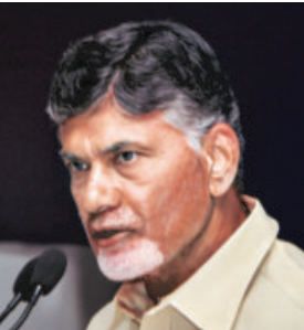
Andhra Pradesh Chief Minister N Chandrababu Naidu calls former Prime Minister P V Narasimha Rao a true Telugu son who built consensus across ideologies

Referring to the controversy over some states accusing the Centre of imposing Hindi, Naidu said Rao had