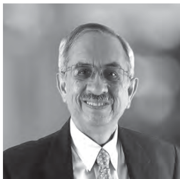
Nadir Godrej Non-Executive Director