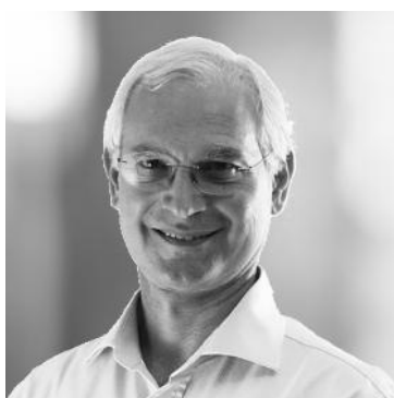
Jamshyd N Godrej Non-Executive Director