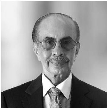
Adi Godrej Chairman, Godrej Group