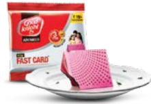
Good knight Fast Card

A disruptive, one rupee, paper-based mosquito solution