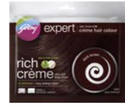
Godrej Expert Rich Hair Crème

A disruptive, one rupee, paper-based mosquito solution