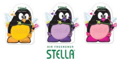
Stella Daily Freshness

A special concentrate aerosol; just one push for protection for an entire room