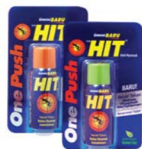
Hit One Push

A special concentrate aerosol; just one push for protection for an entire room